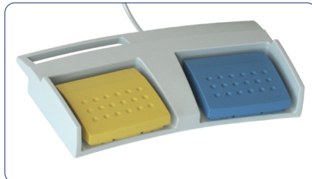
67-901-12 GALAXY SMART FOOT SWITCH